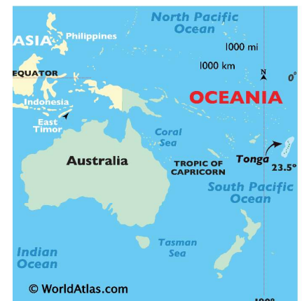
Map of Oceania.