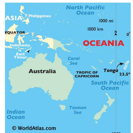
Map of Oceania.