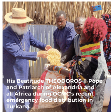
His Beatitude THEODOROS II, Pope and Patriarch of Alexandria and all Africa during OCMC's recent emergency food distribution in Turkana.

Indeed, a great tree of African Orthodoxy has grown from the seed that was first planted so many years ago. The tree continues to grow thanks to you.