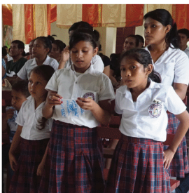
God bless you for your faithfulness and generosity!

Celebrated on June 12. After the Savior's Ascension into Heaven, the Apostles, the most holy Virgin Mary, and other disciples were gathered in the upper room of a house in Jerusalem when suddenly the house was filled with a sound like a rushing wind. Tongues of fire rested on the heads of each, and each was filled with the Holy Spirit and began speaking and proclaiming the Gospel in many different tongues. This represents their ordination and the start of their ministry of preaching the Good News to the nations of the world. This is a mission and a calling we faithfully to carry out to this day, following the holy example of those first ordained on Holy Pentecost.