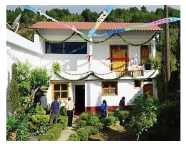
Fr. Andrés Medical and Dental Clinic.

1. The name of the girl in the story is .