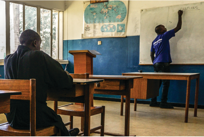
Your love and generosity reach across all of Africa, and help prepare future leaders of the Church, through your partnership with OCMC.

Theological training for future Church leaders is a vital pillar of Orthodox missions. Without it, the work of sharing Christ will suffer. Please continue to sustain the students of Makarios III Seminary with your prayers, and through your generous giving to OCMC. Thank you so much!