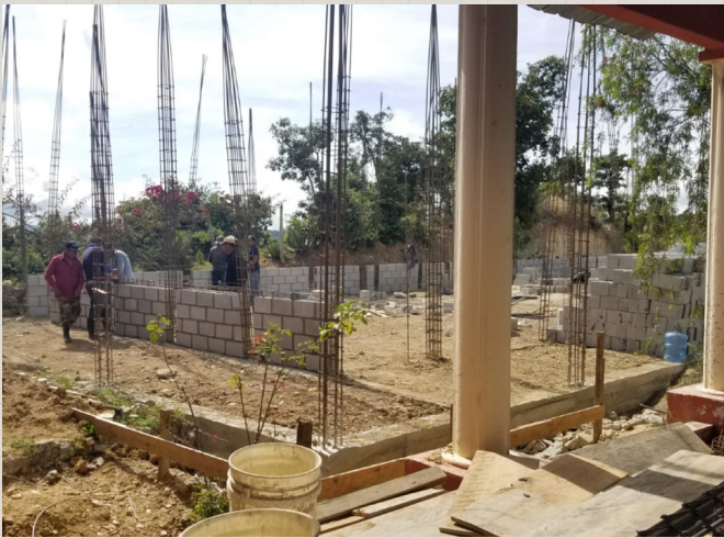
Your generosity is helping build a center where a new generation of clergy and lay leaders can be trained to bring people to Christ and His Church in Central America.