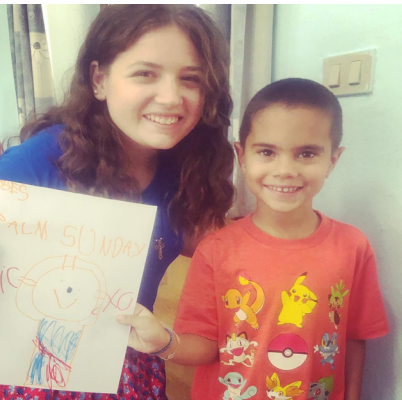
God bless you for your faithfulness and generosity!