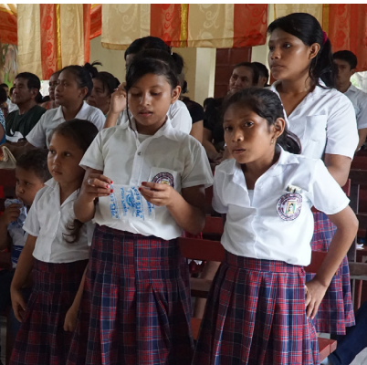
God bless you for your faithfulness and generosity!

O wondrous Iakovos, God the Logos, only-begotten of the Father, who dwelt among us in latter days, declared you, the first shepherd and teacher of Jerusalem, and faithful steward of the spiritual mysteries. Wherefore, we all honor you, O Apostle.