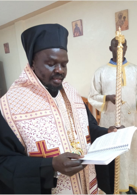
The help you provide as part of our SAMP program reaches out to touch lives in parishes around the world.

We thank God for everyone who supports the work of OCMC with their prayers and financial gifts. But every October, we make a special point of thanking the generous friends who give every month as part of our Support a Mission Priest Program!