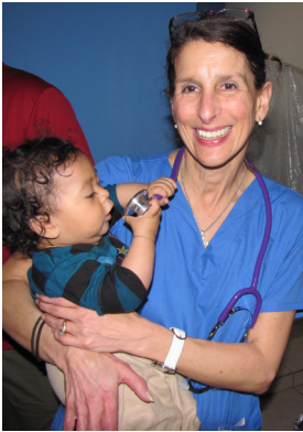
Your generosity touches lives every day. Thank you.