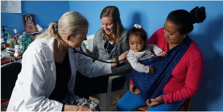
The people of Aguacate have few options for medical care besides our clinic. They thank you for your love and support!