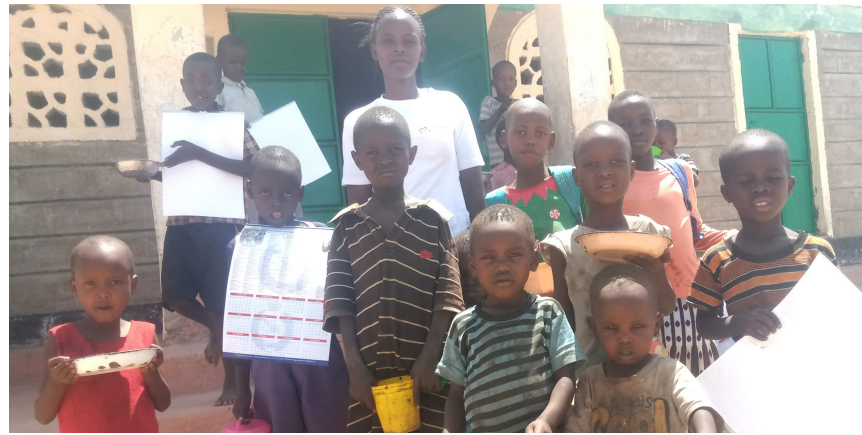
Kenya is a long way from North America, but your generosity and compassion are being felt there daily.