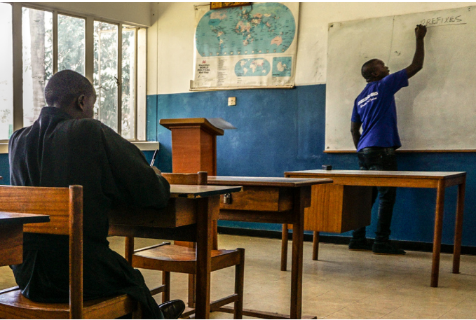
Your love and generosity reach across all of Africa, and help prepare future leaders of the Church, through your partnership with OCMC.

Theological training for future Church leaders is a vital pillar of Orthodox missions. Without it, the work of sharing Christ will suffer. Please continue to sustain the students of Makarios III Seminary with your prayers, and through your generous giving to OCMC. Thank you so much!