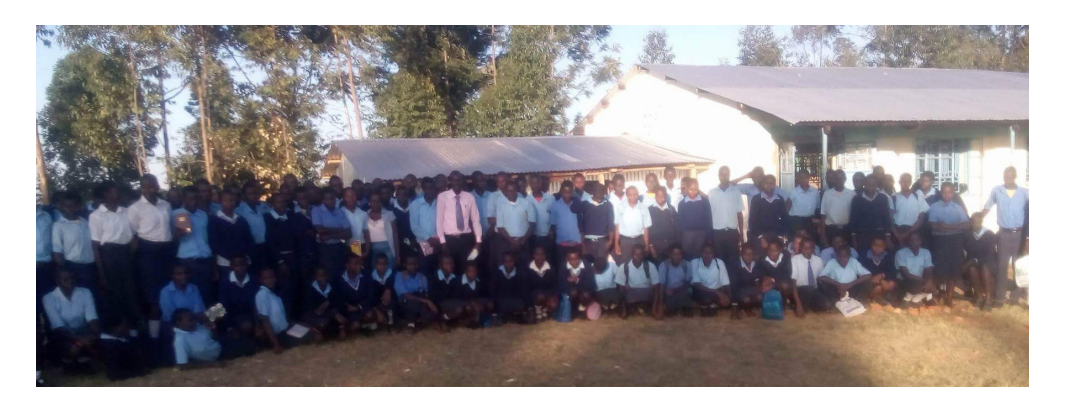
Serving on an OCMC Mission Team lets you touch countless lives ... and make countless new friends as you share Christ's love!

There are many, many more exciting and rewarding Mission Teams on our 2019 calendar. See the latest listings at https://www.ocmc.org/about/open_teams.aspx.