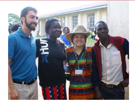
God bless you for your faithfulness and generosity!

Your gift is tax deductible. Please make your check payable to OCMC and send it to 220 Mason Manatee Way, St. Augustine, FL 32086. Please remember OCMC in your estate planning.