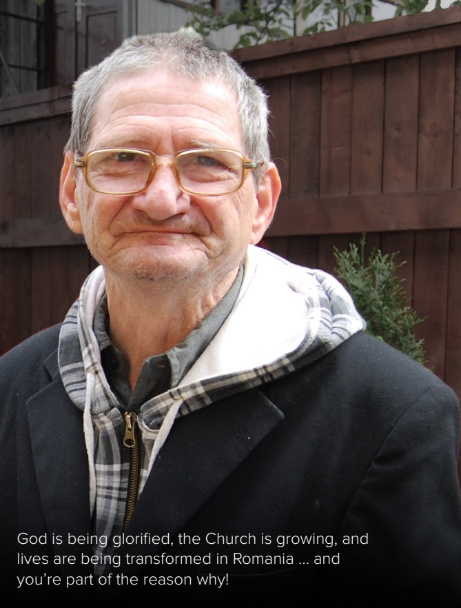
God is being glorified, the Church is growing, and lives are being transformed in Romania ... and you’re part of the reason why!

Romania has one of the fastest-growing economies in Europe. But the good times aren’t reaching everyone. Life is still tough for many, especially those addicted to drugs or alcohol. In the northwest Romanian town of Cluj, your support of the Orthodox Christian Mission Center is bringing hope and healing to hundreds of people, freeing them from addiction and demonstrating God’s grace and love