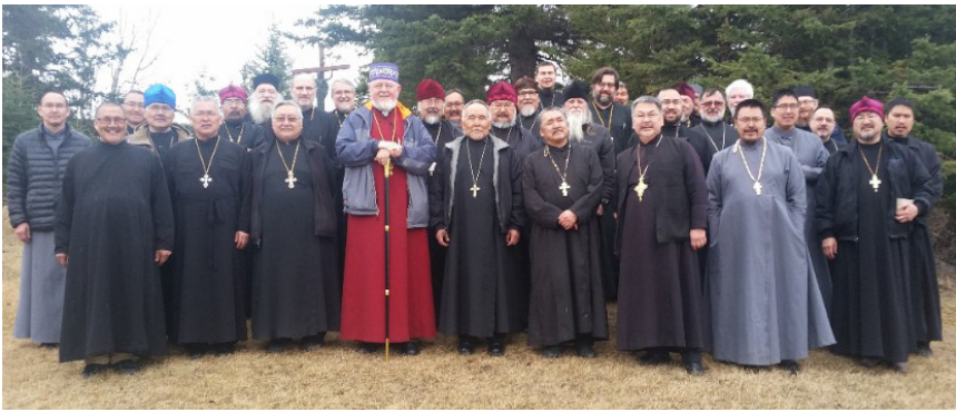
More than 30 priests gathered for a Diocese of Alaska clergy retreat this spring. They agree: God is at work in Alaska!

As the mission field of Saint Herman the Wonderworker and Saint Innocent, Equal to the Apostles and Enlightener of North America, Alaska holds a special place in the heart of many Orthodox Christians in America. Your support of OCMC is helping the Church strengthen and grow in the land where Orthodox evangelism in North America began.