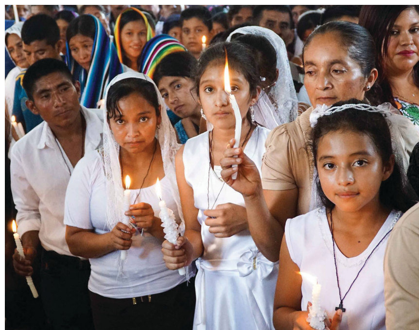
These are some of your new brothers and sisters in Christ. You're part of the reason they're Orthodox Christians today.