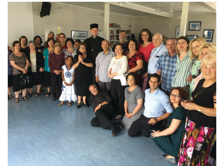
Your support of OCMC helps plant the seeds of the Gospel in the South Pacific, and your hard work is bearing fruit!

Thank you for sharing your Faith around the world through your support of OCMC!