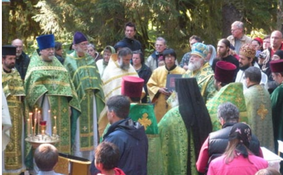
On a pilgrimage in Kodiak, Alaska. Orthodox Christians visit the adoptive home of St. Herman who, as a Russian missionary, participated in planting Orthodox Christianity within regions of North America.

The calling to serve in Alaska did not come easily to Veniaminov. His own heart had to be turned to make the kind of sacrifice that volunteering for foreign mission often requires. He had to convince his bishop and his wife as well. Alaska was still Russian American when young John first heard the reports of the needs in that far away land. Up and down missionary efforts had continued in the Aleutian Chain, Kodiak,