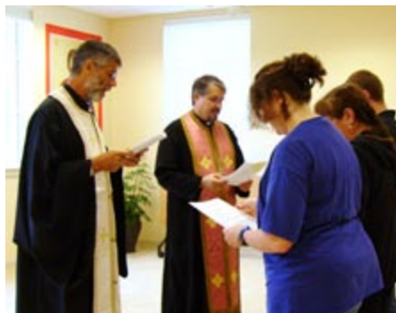
LEFT: Prayer is vital in preparing for service on a short-term Mission Team. At the completion of pre-field orientation, all OCMC Team members are prayed for at a commissioning service to be witnesses of Christ. Team members learn to trust in God and allow Him to use them to do His will.

mission fields each year, according to a survey by Princeton University.