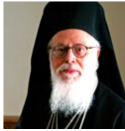
His Beatitude Anastasios, Archbishop of Durres, Tirana, and all Albania has dedicated his life to the service of the Church through missions.