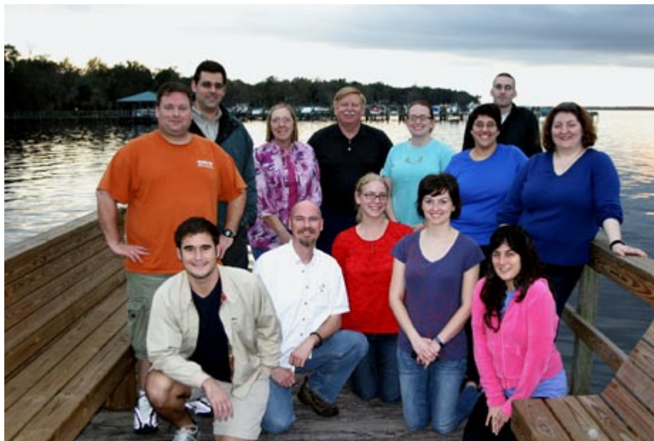
ABOVE: Since 1987, over 1,400 short-term Orthodox Mission Team members have served on over 125 projects in 24 countries. Each of them is prepared for their service during an intensive pre-field orientation.