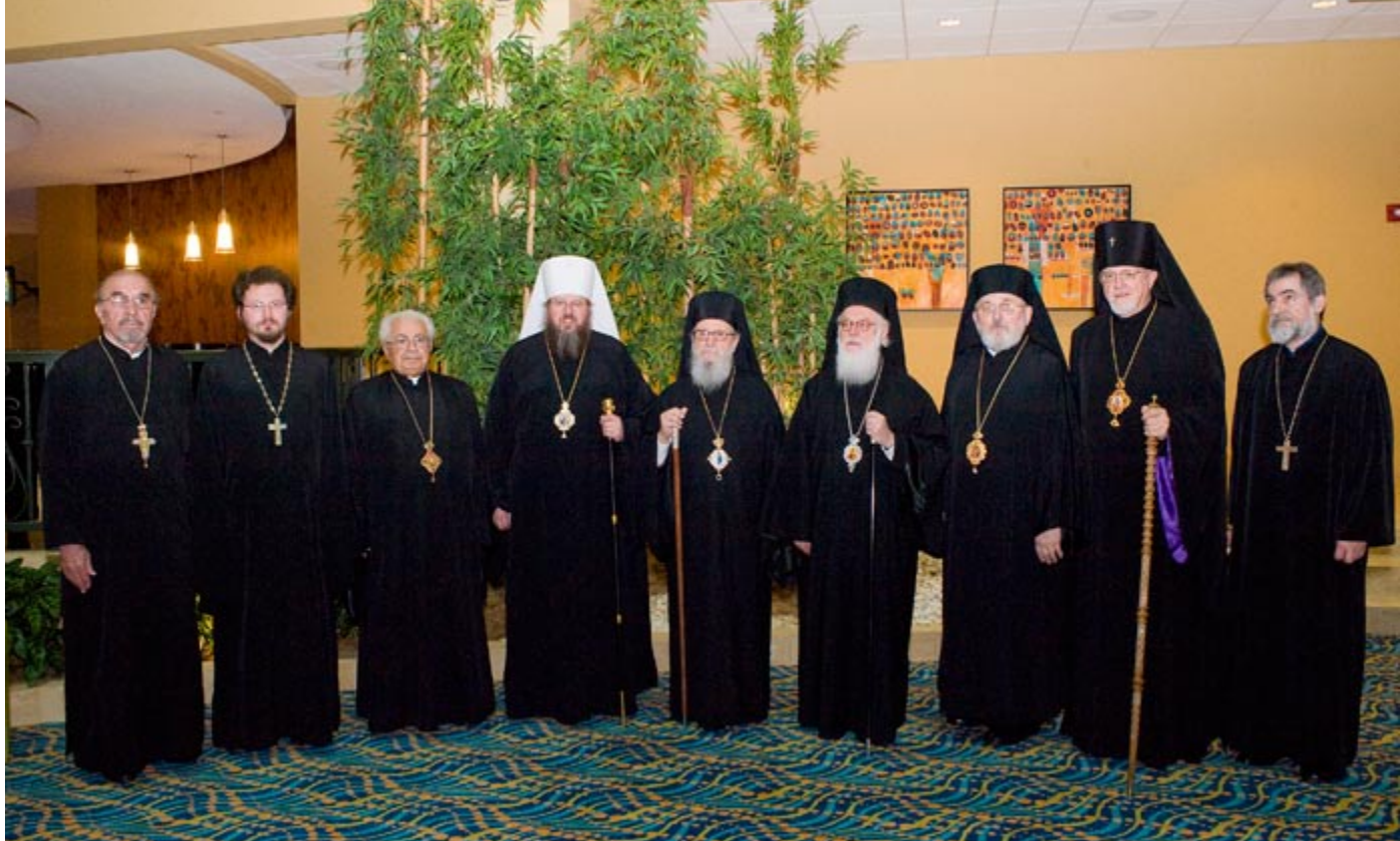
The new Archbishop Anastasios and Archbishop Demetrios Missionary Training and Administration Building is the first permanent structure ever built for an agency of SCOBA. Many SCOBA hierarchs and representatives gathered for the Dedication of this new facility in May, 2009.