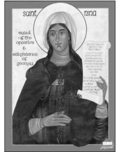
St. Nina Enlightener of Georgia