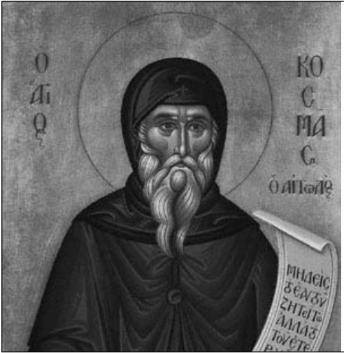
St. Cosmas Aitalos